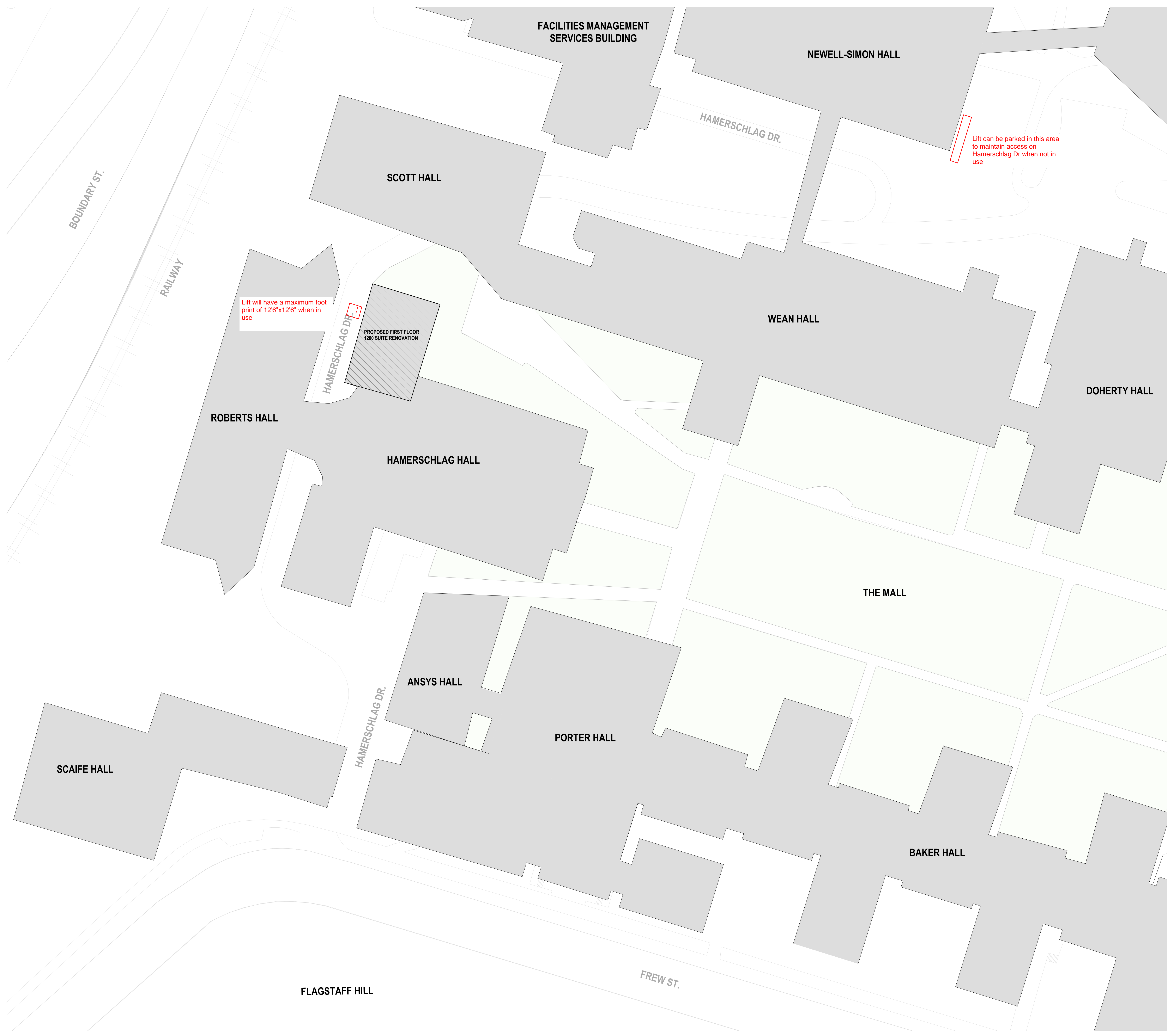
SITE PLAN SCALE: 1" = 40'-0"